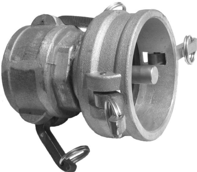
Vapour Recovery Coupler w female 3" coupler