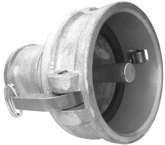
Vapour Recovery Coupler w 3" Hose Shank